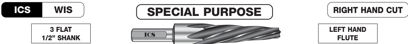
20° SPIRAL FLUTE

High Speed Steel Automotive Steering and Suspension Reamers are manufactured with a taper of 1-1/2" per foot. They are designed for rebuilding and repairing automotive suspension systems. They are used to deburr and enlarge tapered holes for tie rod ends, steering arms, and ball joint applications. They are also referred to as Automotive Taper Reamers or Ball Joint Taper Reamers.