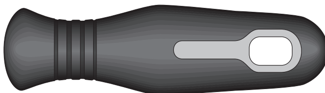
TANG HOLE SHAPES LISTED BELOW

Heavy Duty Plastic File Handles are designed with solid tang hole to fit most popular file tangs from 6" to 12". Rubber coating over durable plastic handle reduces pressure during each stroke action.